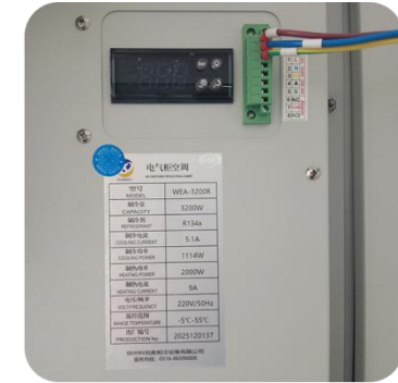
Temperature Control System