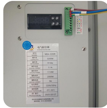
Temperature Control System